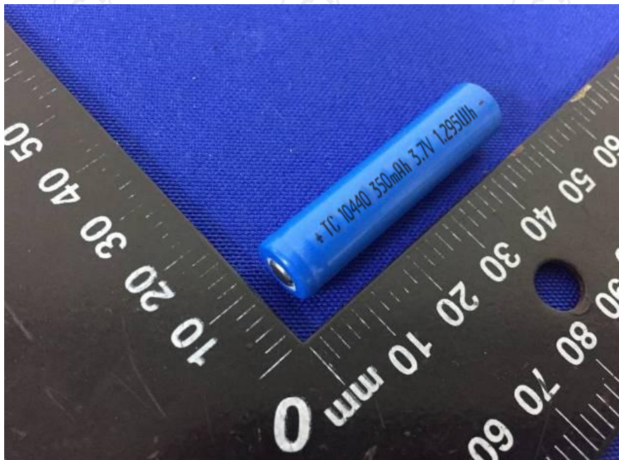
Picture 1. Cell view